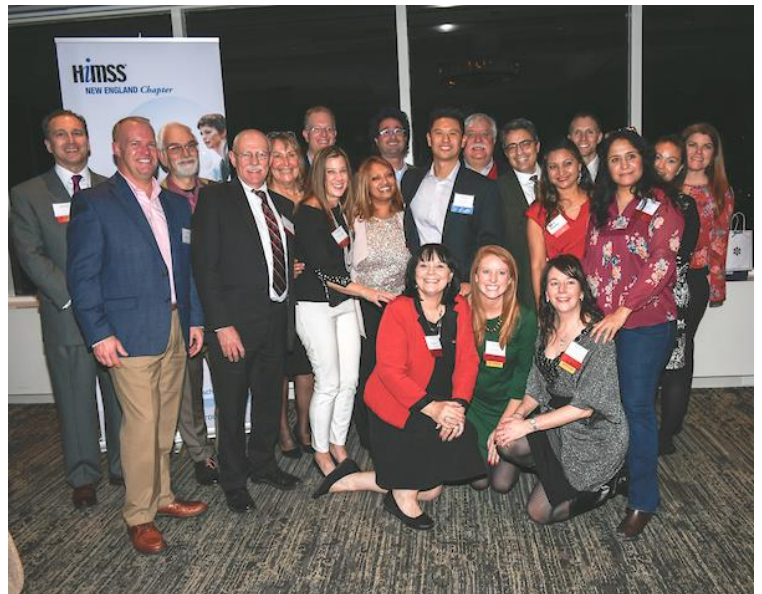
New England HIMSS Chapter Committee Members

Check out more pictures from the New England HIMSS 2018 Annual Holiday Social here . Use the password "holiday18" to download any of the pictures.